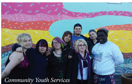
Community Youth Services