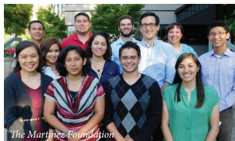
The Martinez Foundation