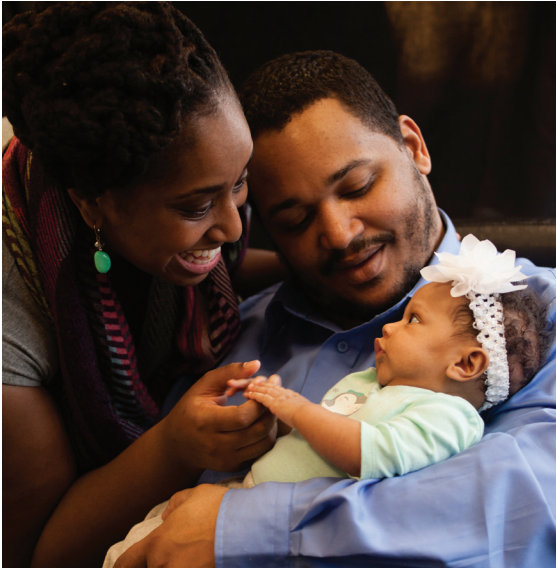
Open Arms Perinatal Services